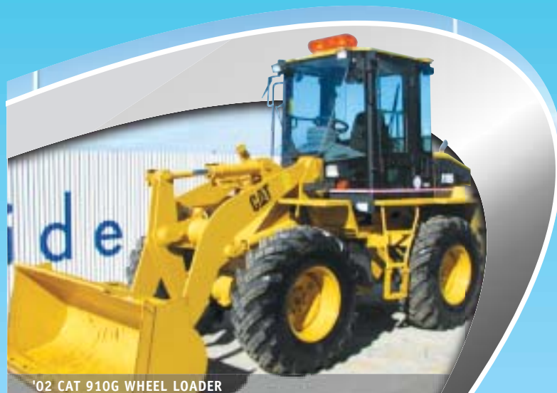
'02 CAT 910G WHEEL LOADER