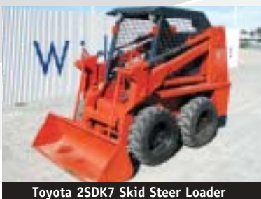
Toyota 2SDK7 Skid Steer Loader