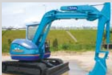
'99 Kubota RX-502 Mini Excavator