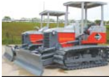
(3) Hitachi DX40M Dozer, 6-way blade