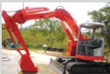
Hitachi EX50URG Mini Excavator