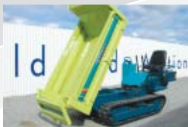
Yanmar C10R Crawler Dumper