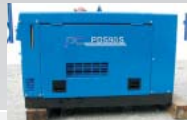
Airman PDS90S 90cfm Air Compressor