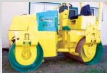
Ammann AV33R Double Drum Compactor