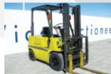
Mitsubishi FG15 1.5 Ton Forklift