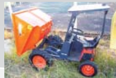
Ausa Skip Dumper