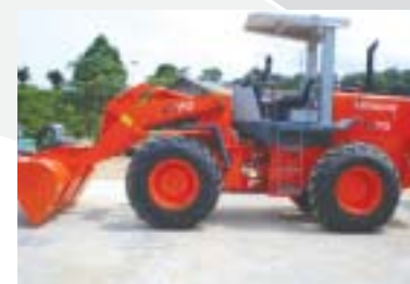
Hitachi LX70 Wheel Loader