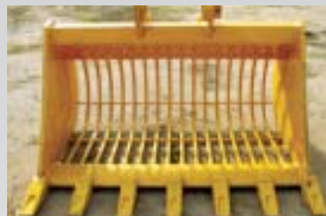
Assortment of Unused Buckets