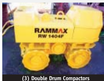
(3) Double Drum Compactors