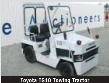
Toyota TG10 Towing Tractor