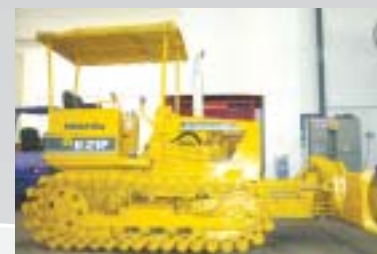
Komatsu D21P Bulldozer