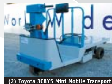
(2) Toyota 3CBY5 Mini Mobile Transport