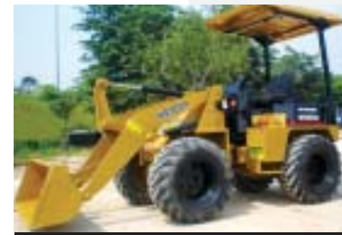
Mitsubishi WS300A Wheel Loader