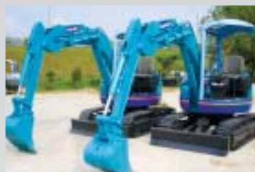
(2) '98 RX302 Kubota Mini Excavators