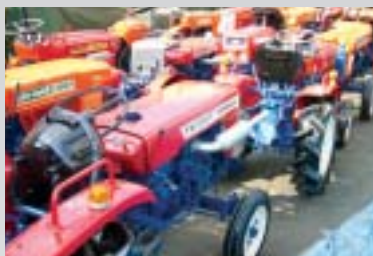
Wide Range of Utility Tractors