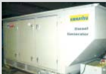
'01 Komatsu ESG185SK 231kva Generator Set