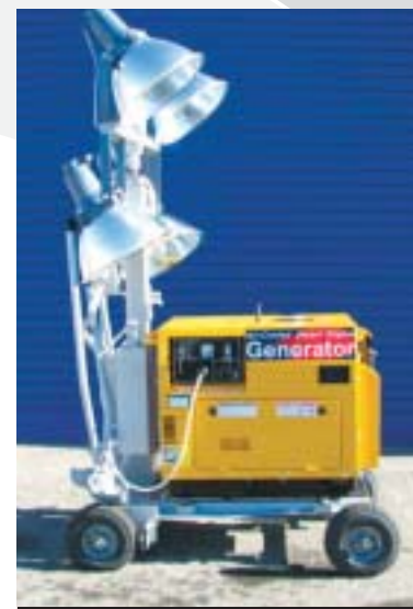
Unused '06 Iseki IK400 Light Towers