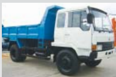
Mitsubishi FM515L 8 Ton Dump Truck