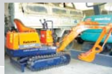
Kubota KH-007 Mini Excavator