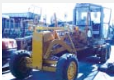
Mitsubishi MG230 Motor Grader