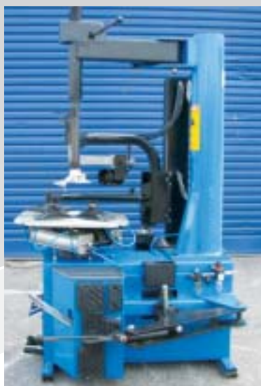
Unused '06 Yokohama S300 Tire Changer