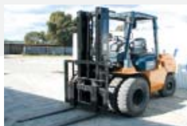
Toyota 7FG45 4.5 Ton Forklift