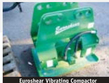
Euroshear Vibrating Compactor