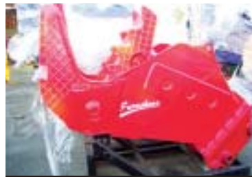
(6) Assorted Demolition Crushers