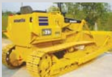
Komatsu D31P-16 Bulldozer