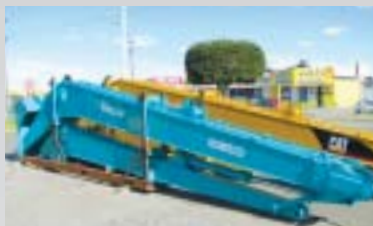
'06 50ft Long Arm, Stick and Bucket