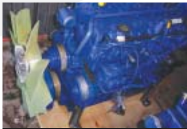
Unused Detroit 638 160hp Turbo Engines