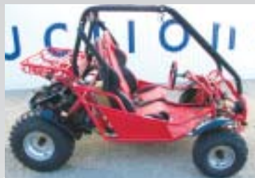
(6) '05 Yamator 4x2 Double Seat Go-Karts