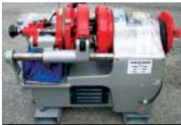
Unused '06 Atlana PT200 Pipe Threader