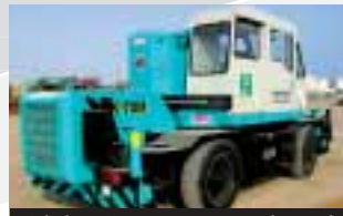
Kobelco RK70M 4.9 Ton Rough Terrain