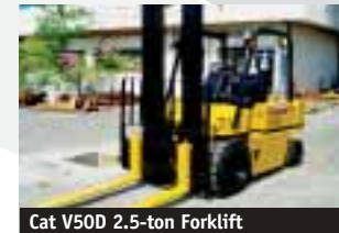
Cat V50D 2.5-ton Forklift