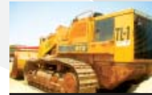
Cat 973 Crawler Loader