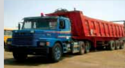
Scania 113 6x4 Truck Tractor