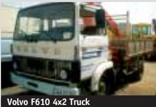
Volvo F610 4x2 Truck