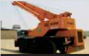
Kato 25 Ton Rough Terrain Crane