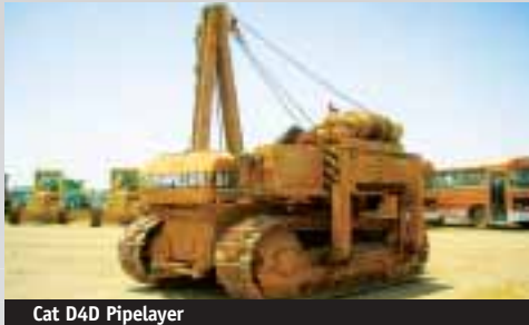
Cat D4D Pipelayer