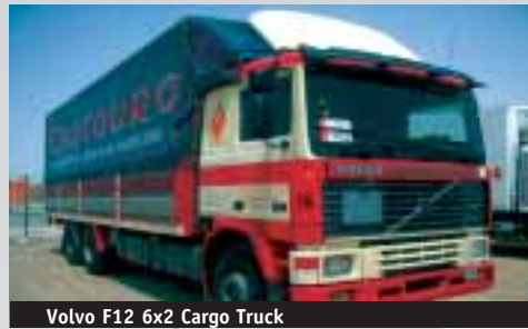
Volvo F12 6x2 Cargo Truck