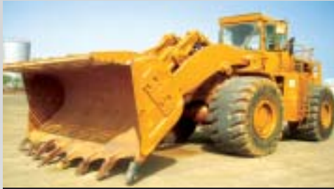
Cat 988B Wheel Loader