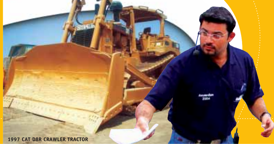
1997 CAT D8R CRAWLER TRACTOR