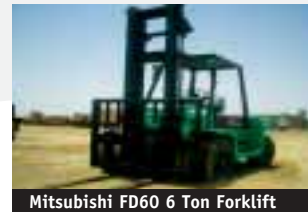
Mitsubishi FD60 6 Ton Forklift