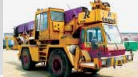
Grove AT633B 30 Ton All Terrain Crane