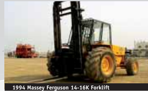
1994 Massey Ferguson 14-16K Forklift