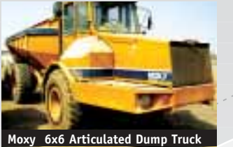
Moxy 6x6 Articulated Dump Truck