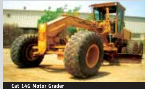
Cat 14G Motor Grader