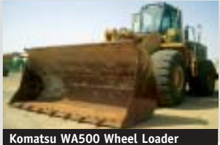
Komatsu WA500 Wheel Loader