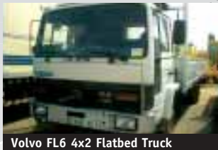
Volvo FL6 4x2 Flatbed Truck