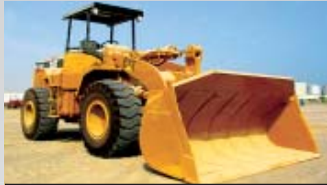
1995 Cat 950F-II Wheel Loader