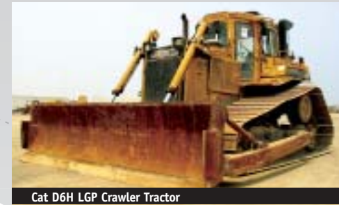
Cat D6H LGP Crawler Tractor