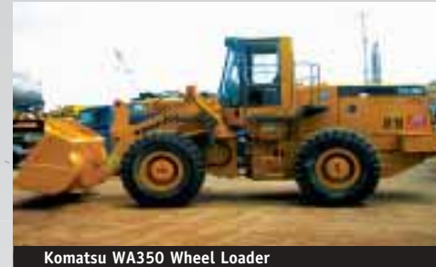
Komatsu WA350 Wheel Loader