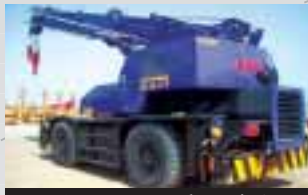
1996 Kato 25 Ton Rough Terrain Crane