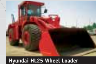
Hyundai HL25 Wheel Loader