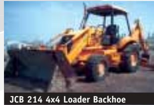
JCB 214 4x4 Loader Backhoe