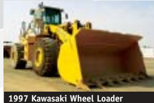
1997 Kawasaki Wheel Loader