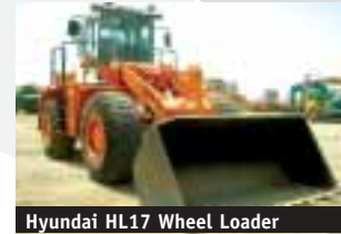
Hyundai HL17 Wheel Loader