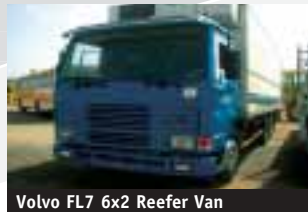
Volvo FL7 6x2 Reefer Van