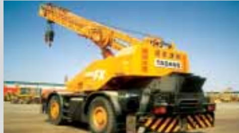
Tadano TR250M-4 25 Ton Rough Terrain Crane