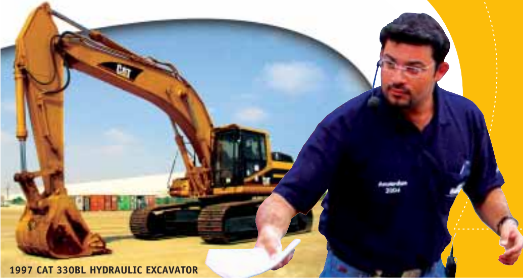
1997 CAT 330BL HYDRAULIC EXCAVATOR