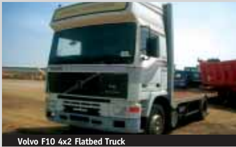
Volvo F10 4x2 Flatbed Truck