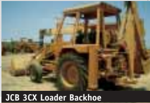
JCB 3CX Loader Backhoe