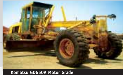
Komatsu GD650A Motor Grade