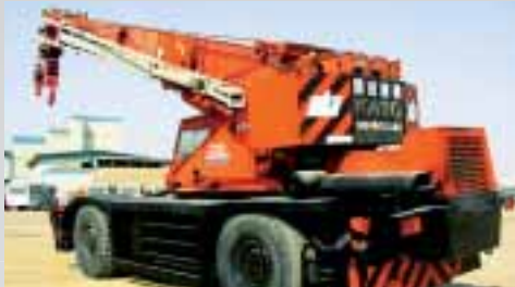
1994 Kato KR451 45 Ton Rough Terrain Crane