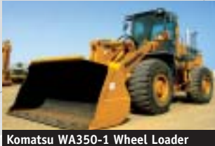
Komatsu WA350-1 Wheel Loader