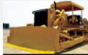
Komatsu D85A-12 Crawler Tractor