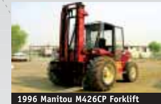
1996 Manitou M426CP Forklift