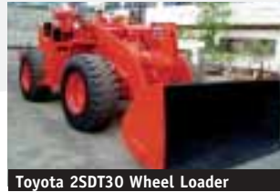
Toyota 2SDT30 Wheel Loader