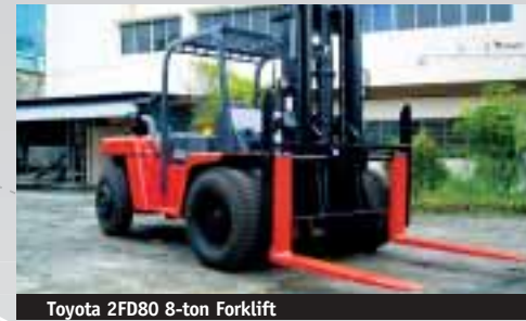
Toyota 2FD80 8-ton Forklift