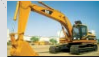
1995 Cat 325L Hydraulic Excavator