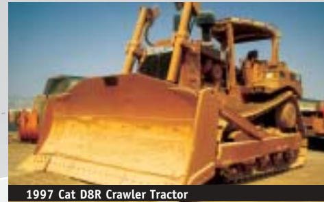
1997 Cat D8R Crawler Tractor