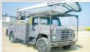
International S1700 4x2 Manlift Truck