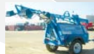
Cummins 300kva Generator Set