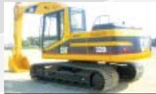
'96 Cat 320-V2 Hydraulic Excavator