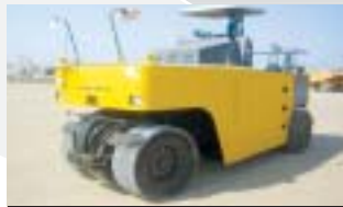
'92 Komatsu Pneumatic Tire Roller