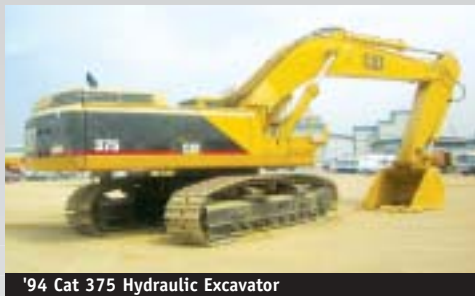
'94 Cat 375 Hydraulic Excavator