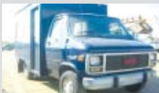
GMC Vandura 3500 4x2 Cargo Van