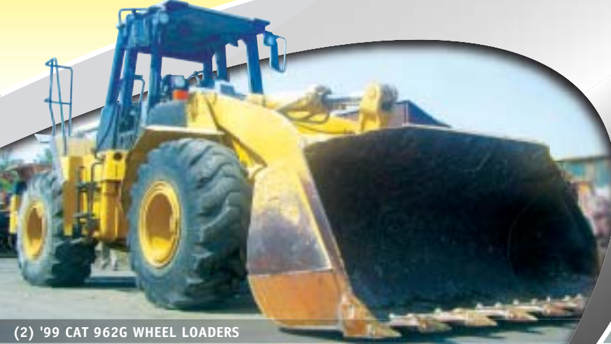
(2) '99 CAT 962G WHEEL LOADERS