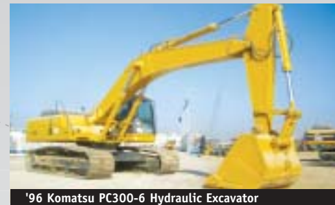
'96 Komatsu PC300-6 Hydraulic Excavator