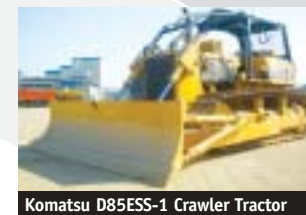
Komatsu D85ESS-1 Crawler Tractor