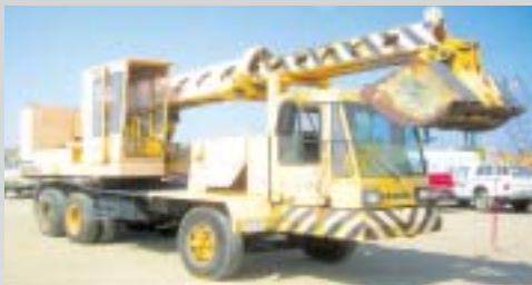
Gradall G660 6x4 Truck Excavator