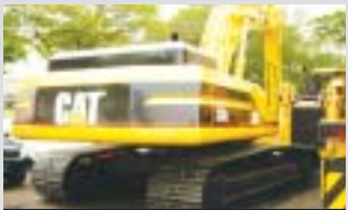
Cat 330L Hydraulic Excavator