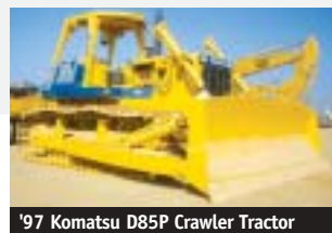
'97 Komatsu D85P Crawler Tractor