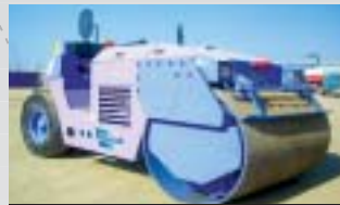
Kawasaki KVR4T Combination Roller