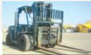
Hyster H155XL 4.5 Ton Forklift