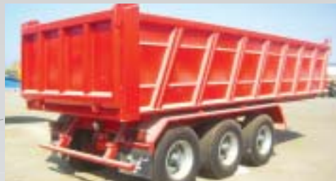
Unused '06 30 Ton Tipper Trailer