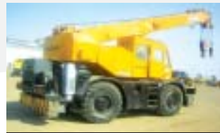
Tadano TR250M-4 Rough Terrain Crane