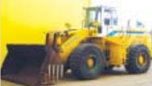
(2) Kawasaki KLD972A Wheel Loader