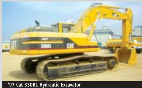
'97 Cat 330BL Hydraulic Excavator