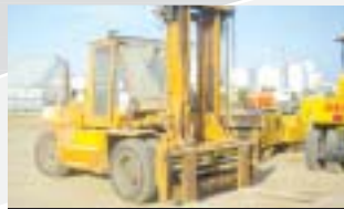
'99 TCM FD120 11 Ton Forklift