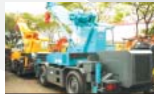
(2) Kobelco RK70M Rough Terrain Crane