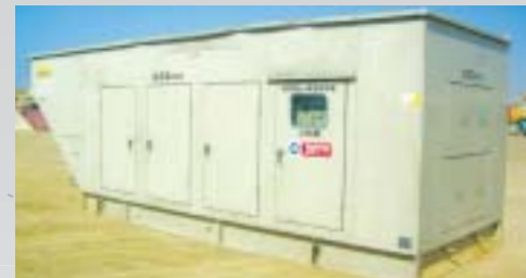
(10) 230 to 623kva Komatsu Generators