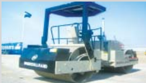
'98 Ingersoll Rand DD90 Double Drum Roller