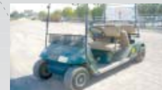
(10) E-Z-GO 4 Seater Golf Carts

1996 Sanwa SS410 410kva Generator Set S/N SGV27405A, c/w 60Hz, silent type, skid mounted (6) 2006 TokyoGen HQ6200CL 6.2kva Generator Set, c/w 50Hz, 220V, petrol engine, open type, Unused (8) 2006 TokyoGen HQ5500S 5.5kva Generator Set, c/w 50Hz, dsl engine, silent type, Unused