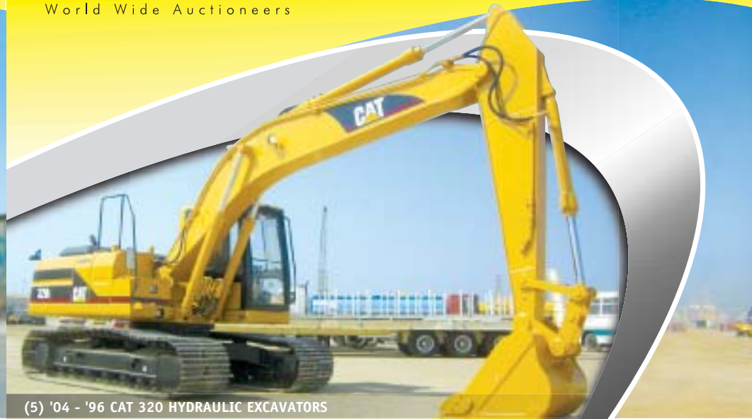
(5) '04 - '96 CAT 320 HYDRAULIC EXCAVATORS