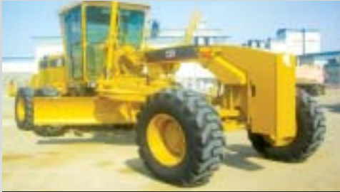
(2) '06 Cat 12H Motor Graders