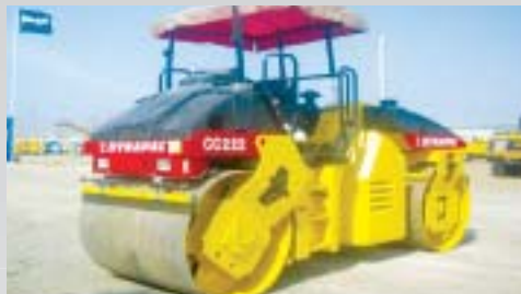
'02 Dynapac CC222 Double Drum Roller