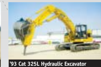
'93 Cat 325L Hydraulic Excavator