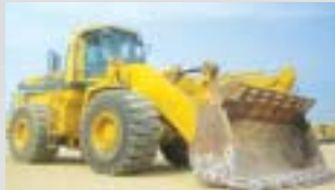
'97 Komatsu WA600-1 Wheel Loader