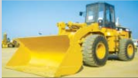
(5) '93-98 Cat 950F-II Wheel Loaders