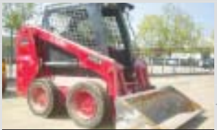
'96 Scat Trak 1300C Skid Steer Loader