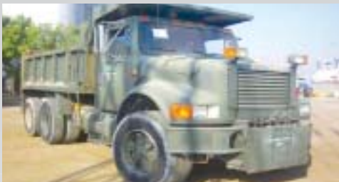
International Navistar 4900 6x4 Dump Truck