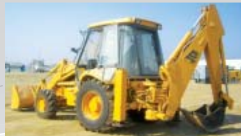
'92 JCB 3CX-4 4x4 Loader Backhoe