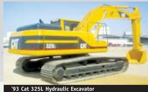
'93 Cat 325L Hydraulic Excavator