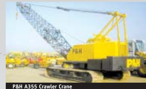
P&H A355 Crawler Crane