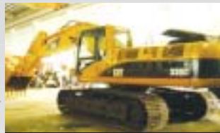
Cat 330C Hydraulic Excavator