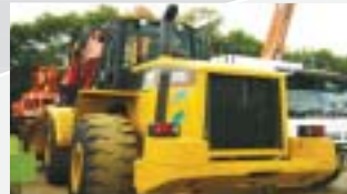
'00 Cat 972G Wheel Loader