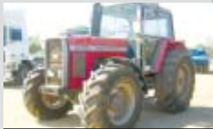
'94 Massey Ferguson MF2720 4x4