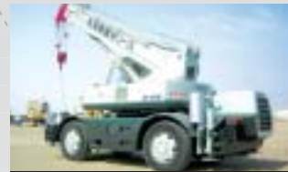
Kato KR10HM Rough Terrain Crane