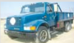
International 4x2 Cargo Truck