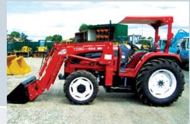
2007 Foton-Europard 60hp Ag Tractor