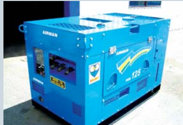
Airman 125cfm Air Compressor