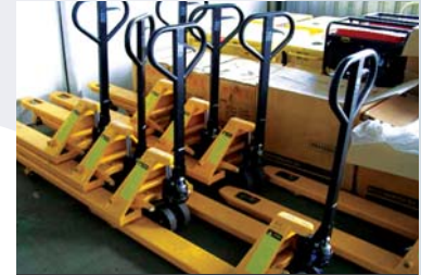
Choice of 2007 Pallet Trucks Unused