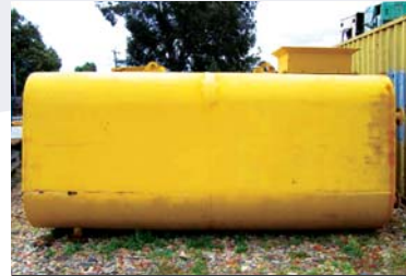
2008 13,000 ltr Water Tank