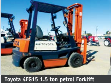
Toyota 4FG15 1.5 ton petrol Forklift