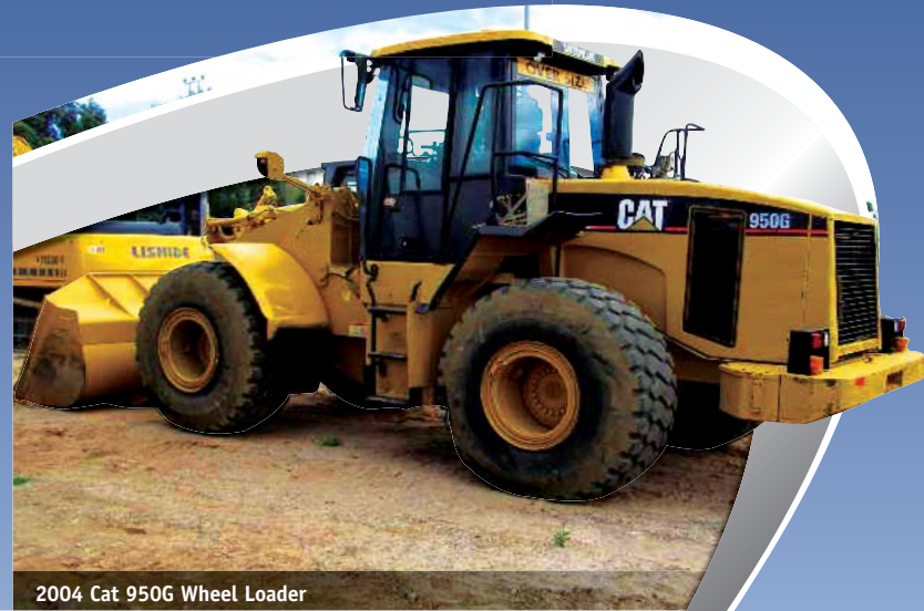
2004 Cat 950G Wheel Loader

WWA Australia Pty Ltd, Western Australia's leading auction house for heavy equipment, offers consignors the opportunity to sell their unwanted equipment at Unreserved or Reserved prices*.