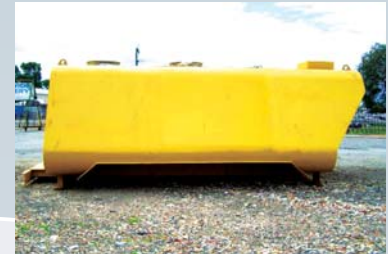
2008 33,000 ltr Water Tank