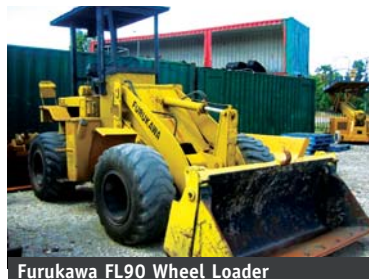
Furukawa FL90 Wheel Loader