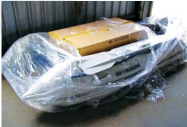
1 of Several Inflatable Boats Unused