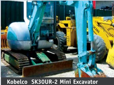
Kobelco SK30UR-2 Mini Excavator