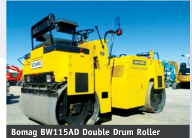
Bomag BW115AD Double Drum Roller