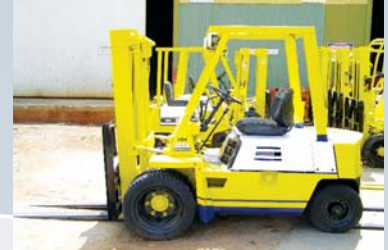
Komatsu FG20-7 2 ton petrol Forklift