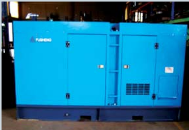
2008 Fusheng 150 Kva Genset