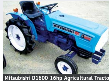
Mitsubishi D1600 16hp Agricultural Tractor