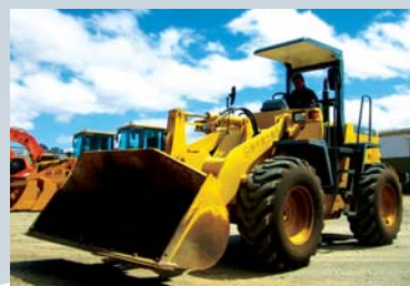
Komatsu WA 100-3 Wheel Loader