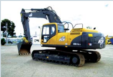
2007 XCG330LC-8 Hydraulic Excavator