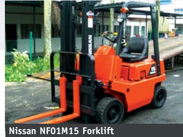
Nissan NF01M15 Forklift