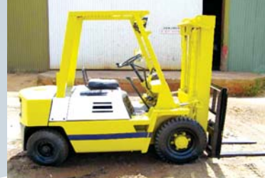
Komatsu FG25-7 2.5 ton petrol Forklift