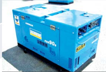
1 of 2 Airman 90cfm Air Compressors