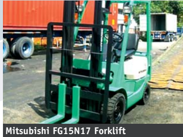
Mitsubishi FG15N17 Forklift