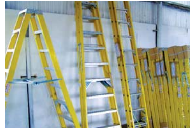
Choice of Ladders Unused