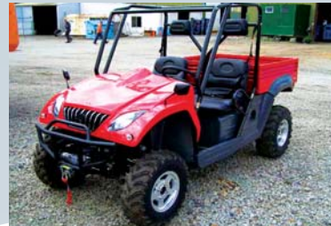
1 of 2 2008 Donkey Carts Unused