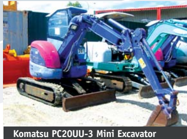
Komatsu PC20UU-3 Mini Excavator