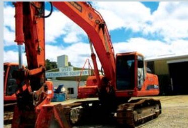
Daewoo SL300LC-V Hydraulic Excavator