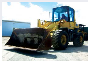
Komatsu WA80-3 Wheel Loader