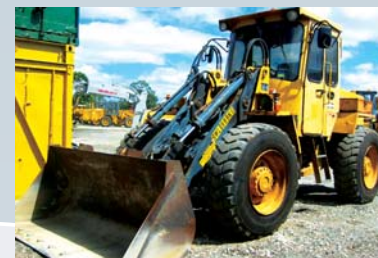
Volvo L30 Wheel Loader