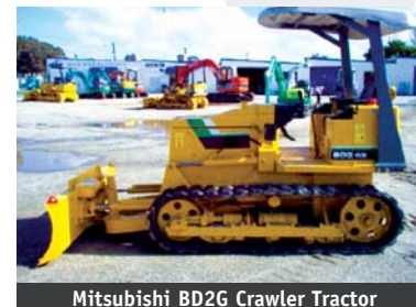
Mitsubishi BD2G Crawler Tractor