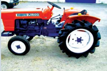
Kubota L1500 15hp Agricultural Tractor