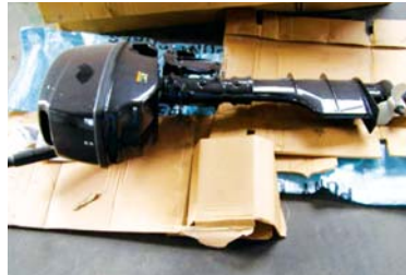
1 of 2 2008 5hp Outboard Engines Unused