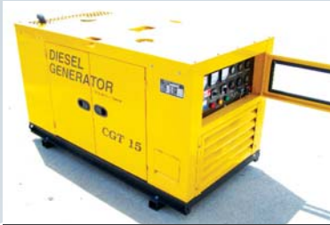
2007 Unused 15Kva Diesel Generator