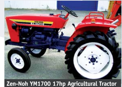
Zen-Noh YM1700 17hp Agricultural Tractor