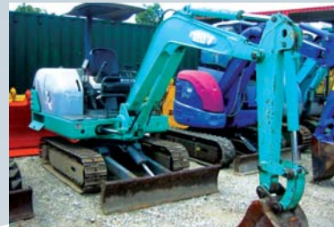
IHI 25J Mini Excavator