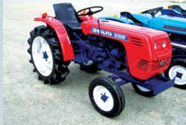
Shibaura SD1500B 15hp Agricultural Tractor