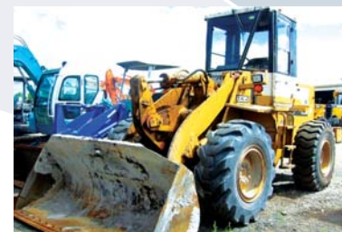
TCM 835-2 Wheel Loader