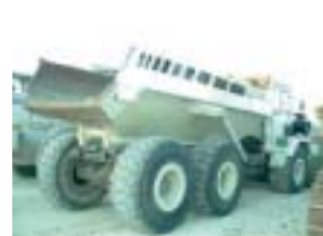
'96 Terex 2566C 6x6