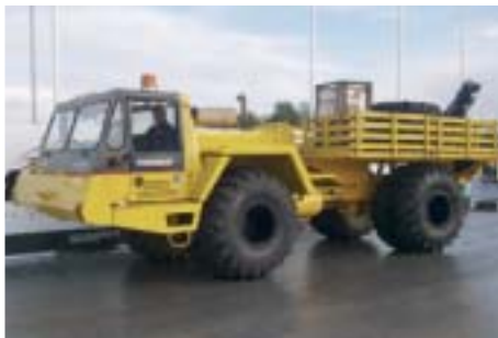
Foremost Delta Artic Project Truck