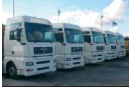
'03 MAN 18.463 FLS TGA Choice of 5 pieces