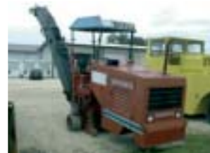
'94 Bitelli SF60T3