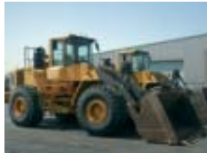
'02 Volvo L150E, Choice of 5 Pieces