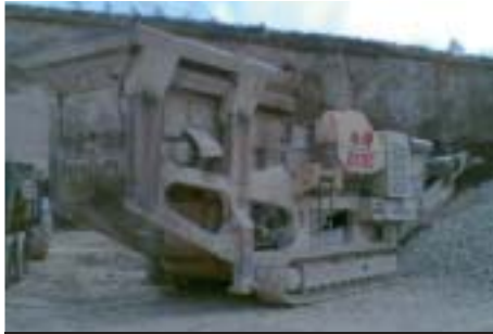
'00 Extec Megabite Mobile Crusher