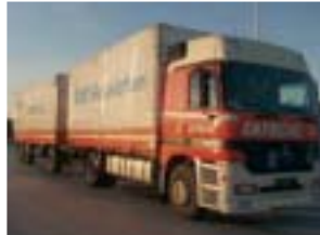
'00 MB 1841 LS Cargo, Choice of 2