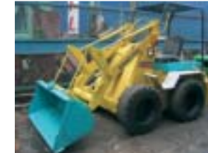
Kobelco SK07-2 Skid steer Loader