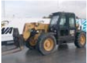
'00 Caterpillar TH62