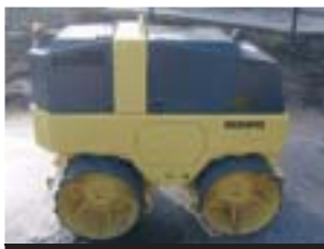
Bomag Double Drum Compactor