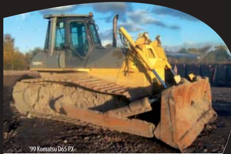
'99 Komatsu D65 PX

For more information and assistance, please fill in the above form and fax to WWA, Europe Office.