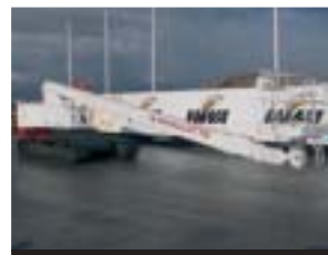
Haulotte 76CH Crawler Manlift