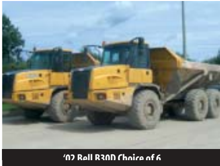
'07 Ball R30D Choice of 6