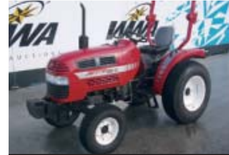
'05 Janma 25-2 Unused