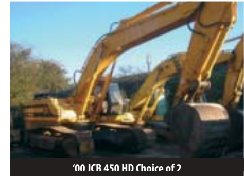
'00 ICB 450 HD Choice of 2