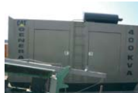
Cat 400 KVA Genset