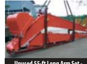
Unused 55-ft Long Arm Set - Hitachi EX200 & ZX200 Excavator