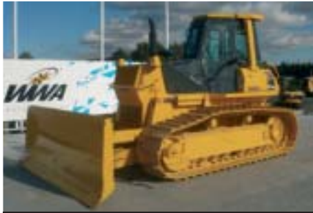
'00 Komatsu D61EX