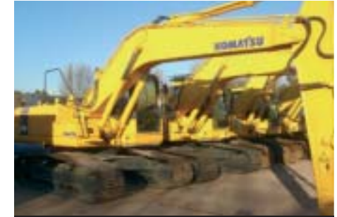
'02 '03 Komatsu PC210 Choice