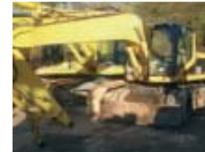
'00 Cat M320