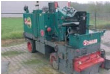
Marks SF502 Asphalt Pro