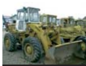
Furukawa FL170 4x4