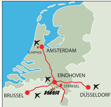
A2 Direction Amsterdam