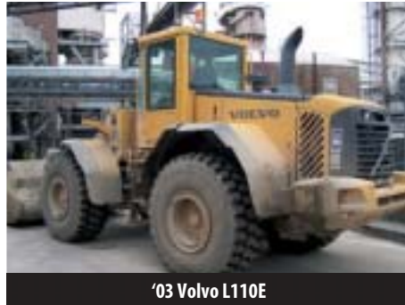
'03 Volvo L110E