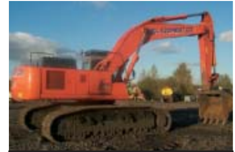
'04 HITACHI ZX450LC