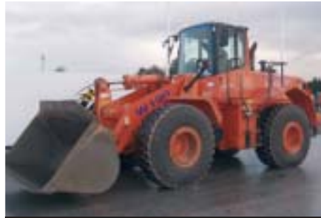
'00 Fiat Hitachi W190