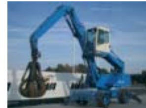
'98 Fuchs MHL 320