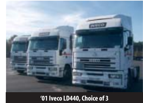
'01 Iveco LD440, Choice of 3