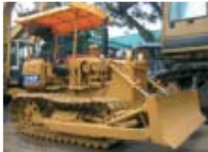
Komatsu D20P-3 Crawler Tractor