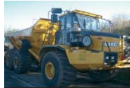
'99-'02 Bell B40C, Choice of 5