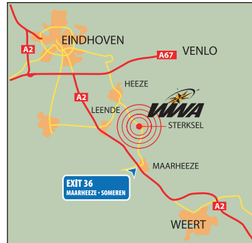
A2 Direction Maastricht

WWA Europe Auctions Phone: +31 40 2076041 Fax: +31 40 2063600 Email: europe@wwauctions.com Website: www.wwauctions.com