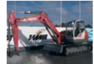
'01 Neuson 12002RDV