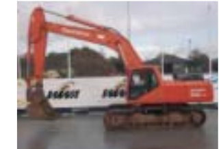
'00 Daewoo 300 Solar LC